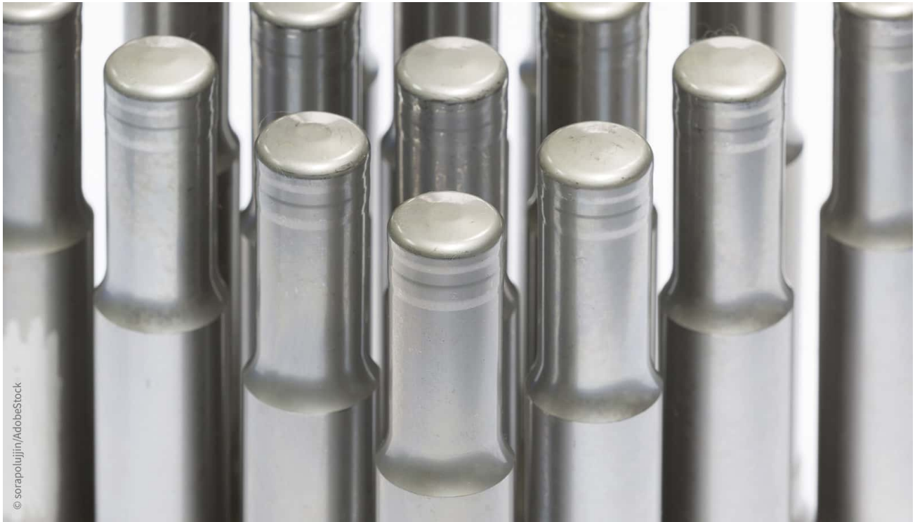
Milling punches from carbide: CCDia®CarbideSpeed® ensures excellent surface finishes.