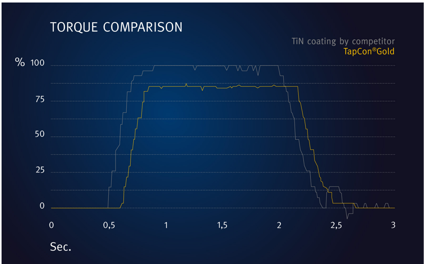
A stable low torque is enormously important for precise and efficient thread production. The newly developed HiPIMS coating material TapCon®Gold has been tailored specifically to these requirements and is the ideal coating base for HSS taps and thread formers.