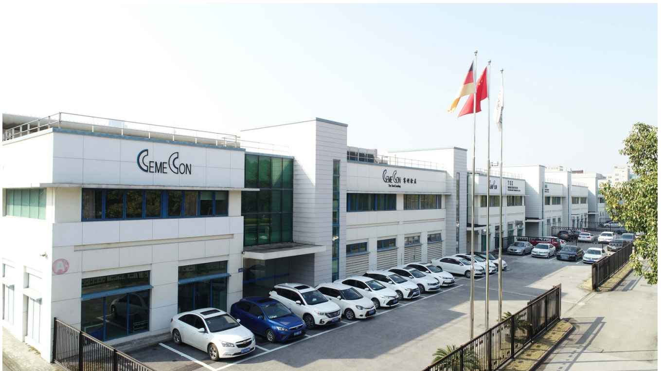
CemeCon has doubled the capacity of the premium coating center in Suzhou, China.